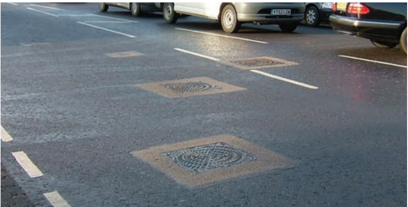
COMPLETED IRONMASTER INSTALLATIONS AT A BUSY INTERSECTION