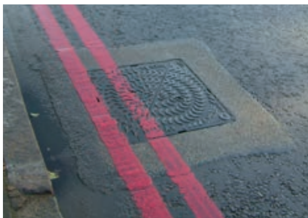
IRONMASTER® ON ONE OF LONDON'S BUSY RED ROUTES

Challenge us to repair your most persistent offending gully/manhole and see exactly why Ironmaster® comes with the industry unique 5 year guarantee.